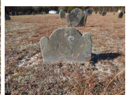
After 2017 Restoration