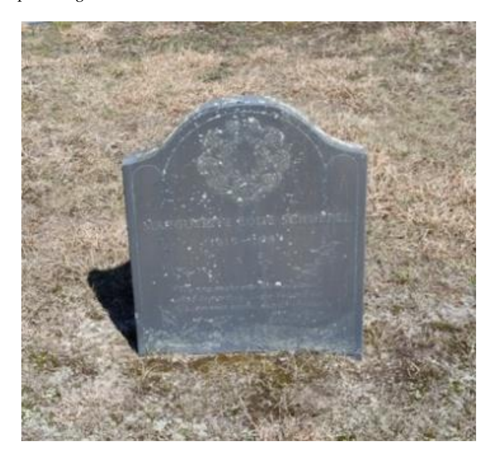
(Wreath) MARGUERITE COLIE SCHNEPEL 1915 – 1987