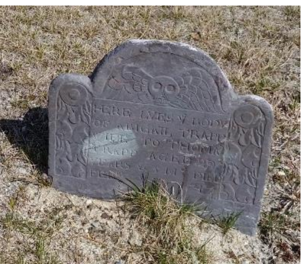
After 2017 Restoration

(Flying Skull) HERE LYRES YE BODY OF ABIGAIL TRAPP WIFE OF THOMAS TRAPP AGED 29 YEARS, 5 DAYS DIED FEBRUARY 14, 1717 AE 29 MONTHS, 5 DAYS