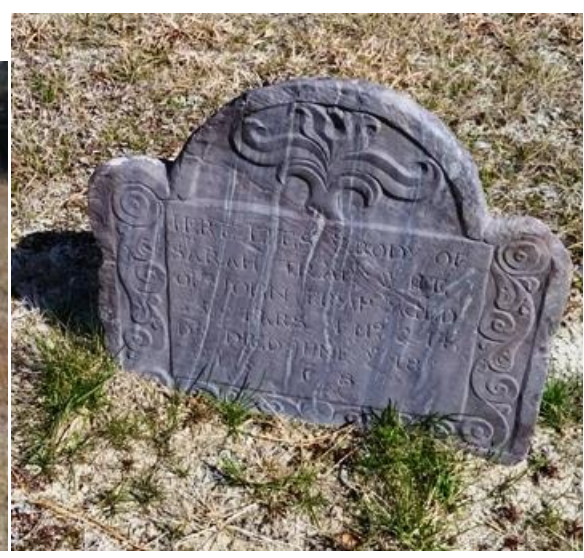
After 2017 Restoration

(Flying Skull) HERE LYES YE BODY OF SARAH TRAPP, WIFE OF JOHN TRAPP AGED 35 YEARS, 4 M<sup>o</sup> & 14 D<sup>s</sup> DIED JUNE YE 18<sup>TH</sup> 1718