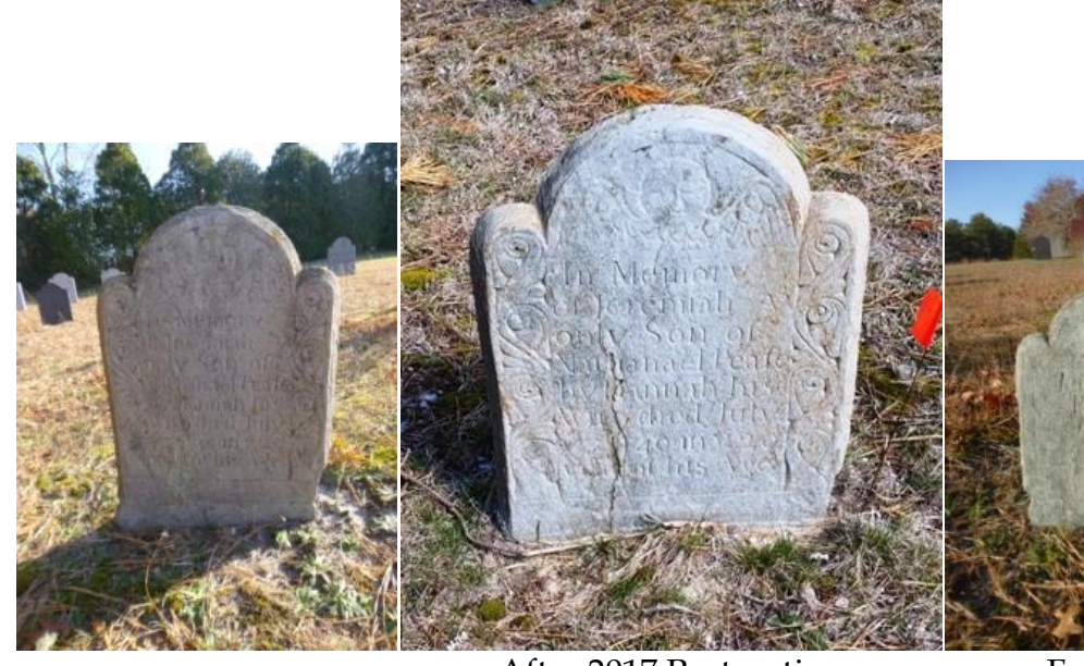
After 2017 Restoration