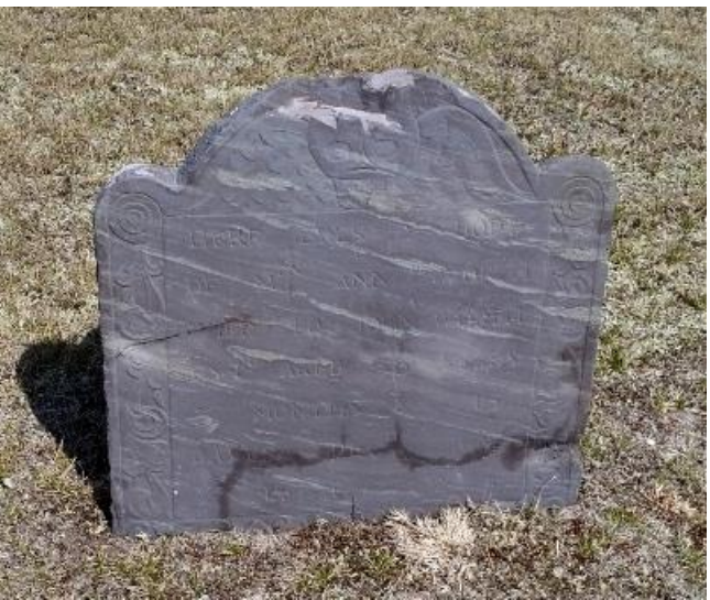
After 2017 Restoration