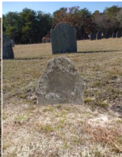
After 2017 Restoration