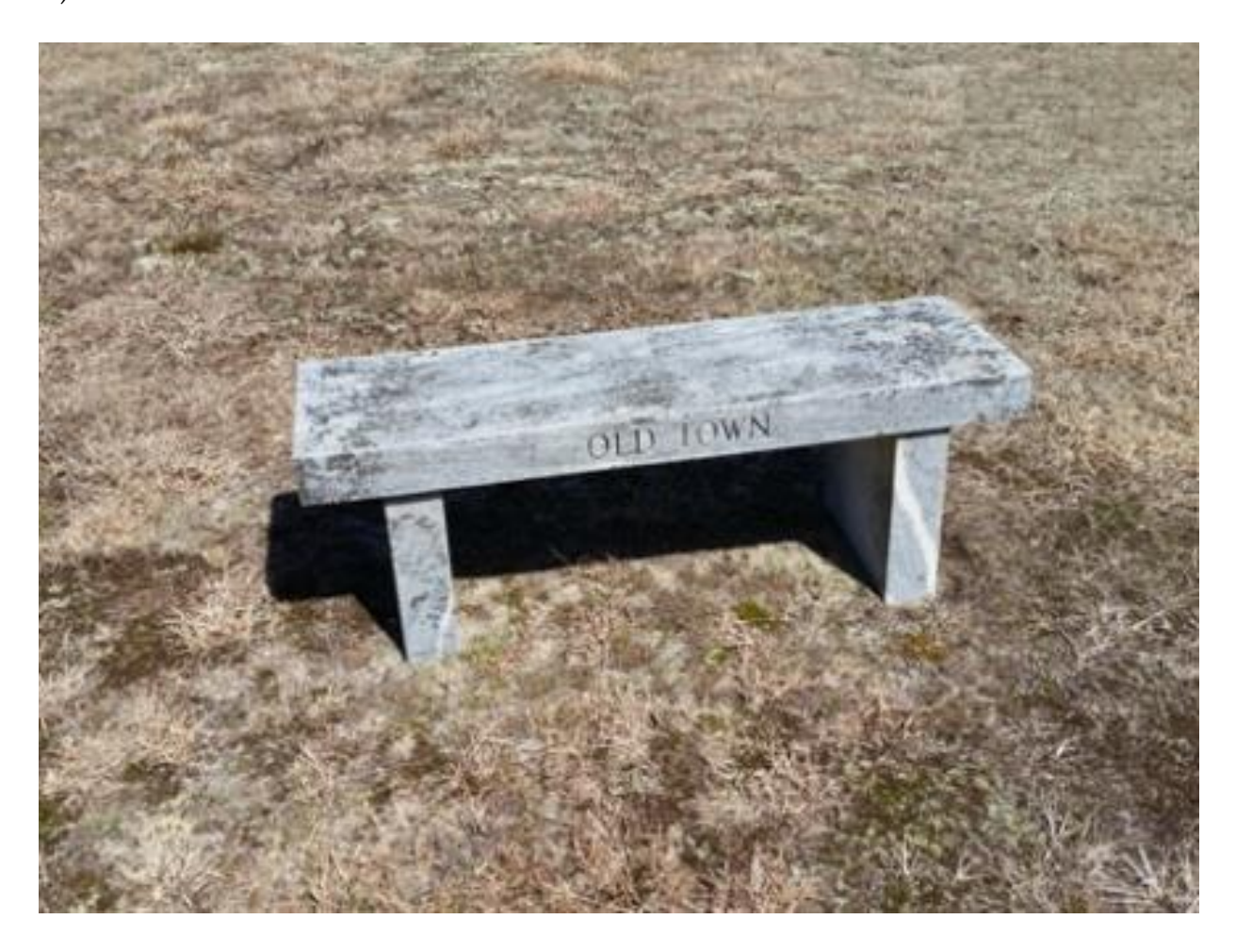
TOWER HILL BENCH