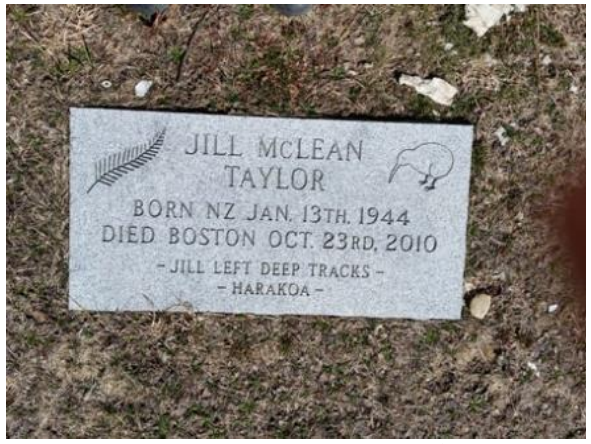
(Silver Fern) JILL MCLEAN (Kiwi)