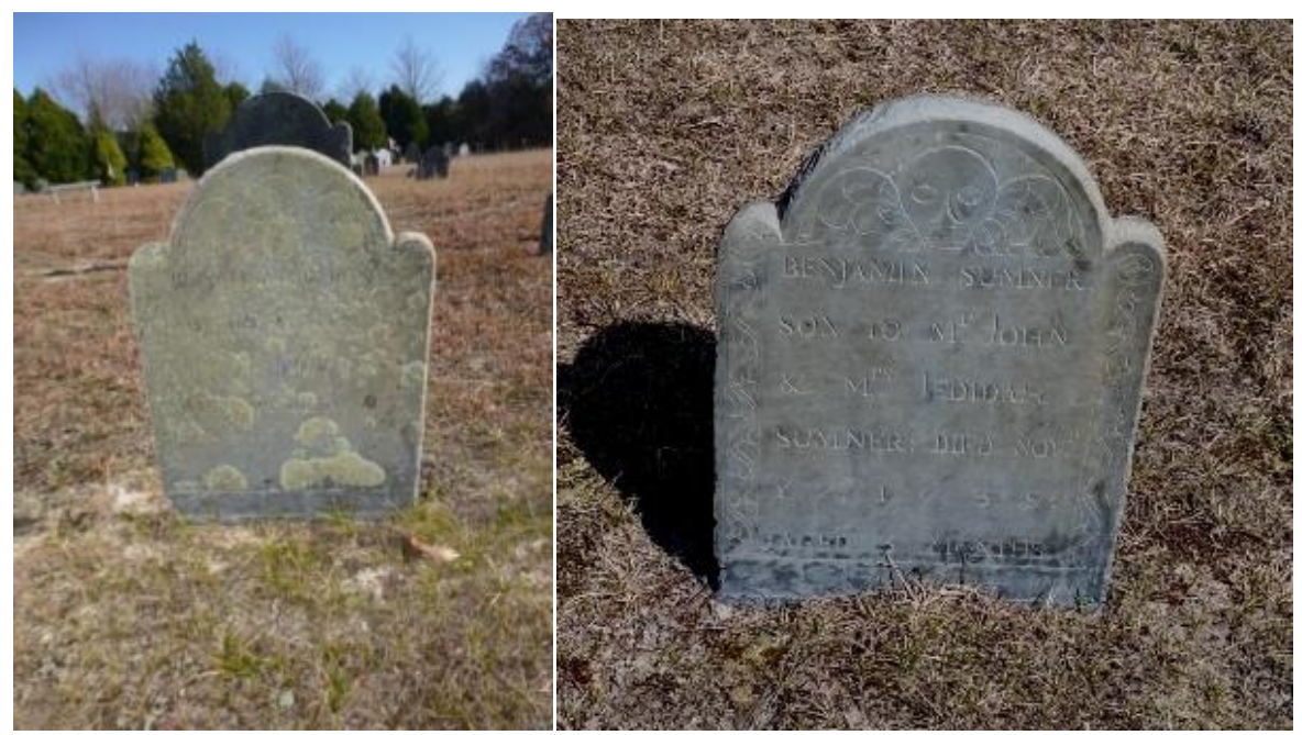
After 2017 Restoration