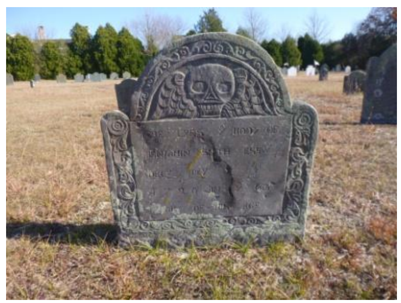
After 2017 Restoration (Flying Skull)