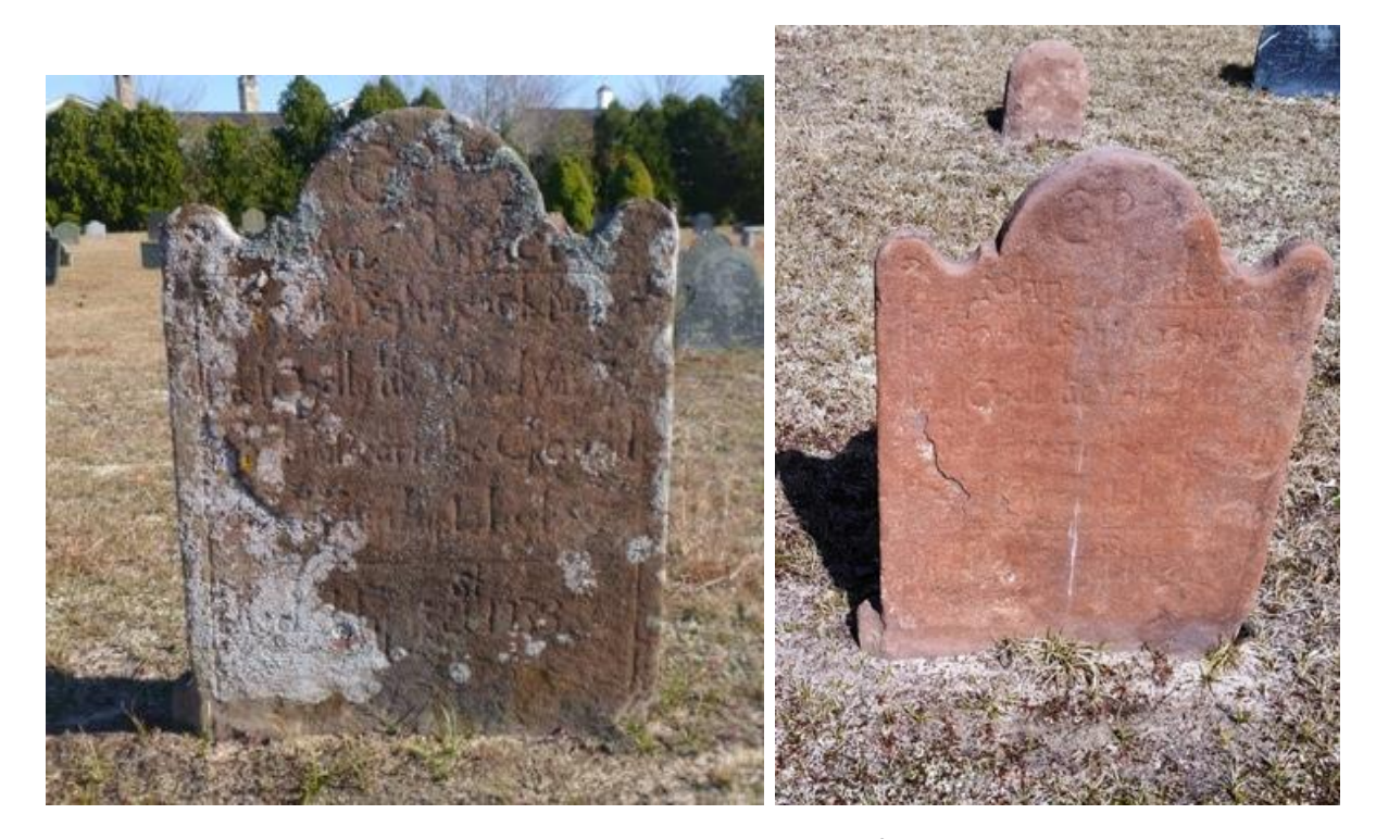
After 2017 Restoration