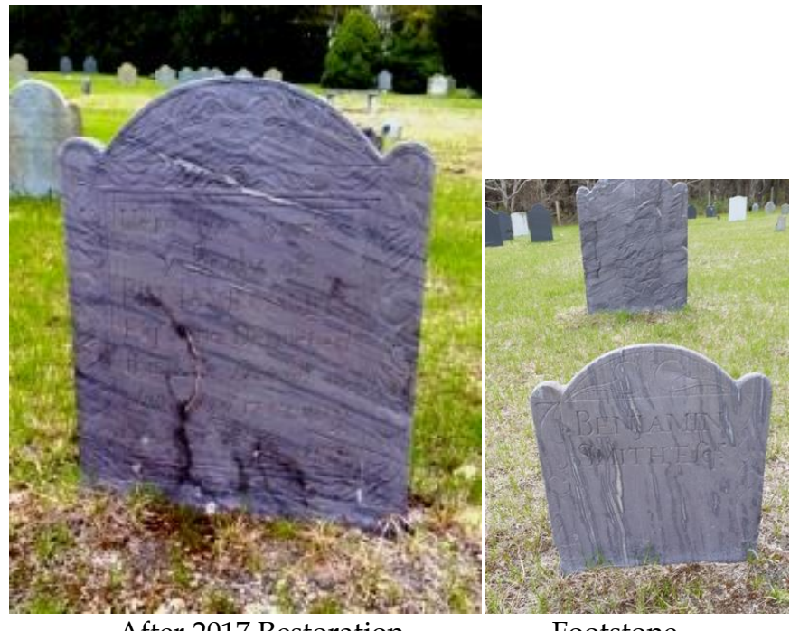
After 2017 Restoration