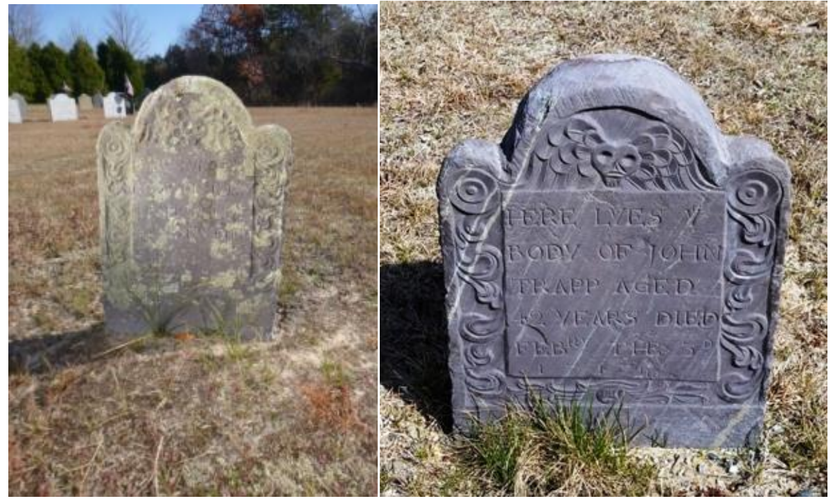
After 2017 Restoration

(Flying Skull) HERE LYES YE BODY OF JOHN TRAPP AGED 42 YEARS DIED FEB. 3, 1717