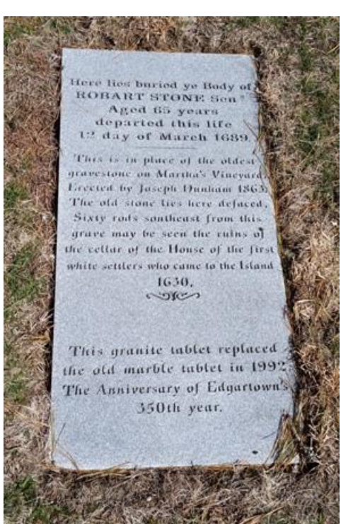
After 2017 Restoration