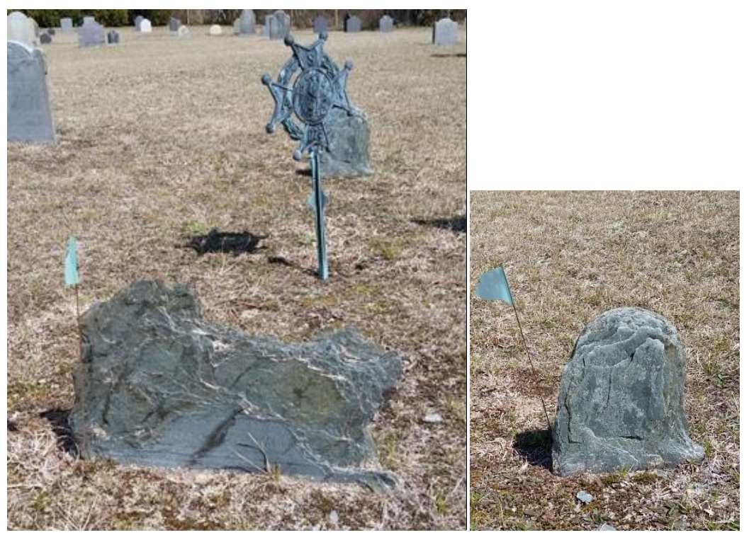
Possibly Timothy Smith's head and foot stones