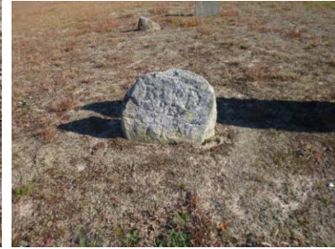
After 2017 Restoration (Flying Soul)