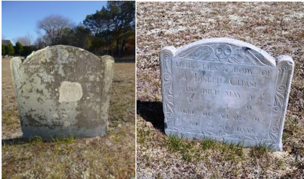
After 2017 Restoration