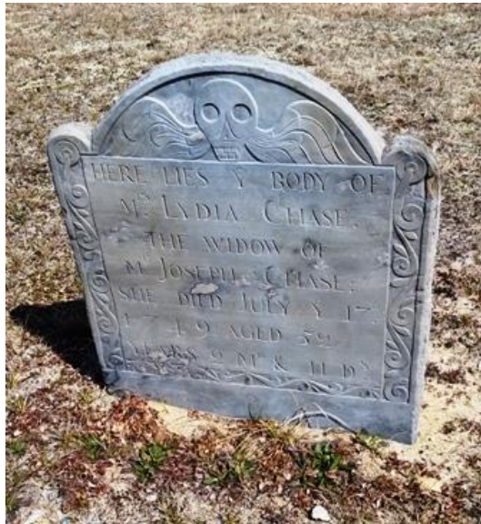
After 2017 Restoration