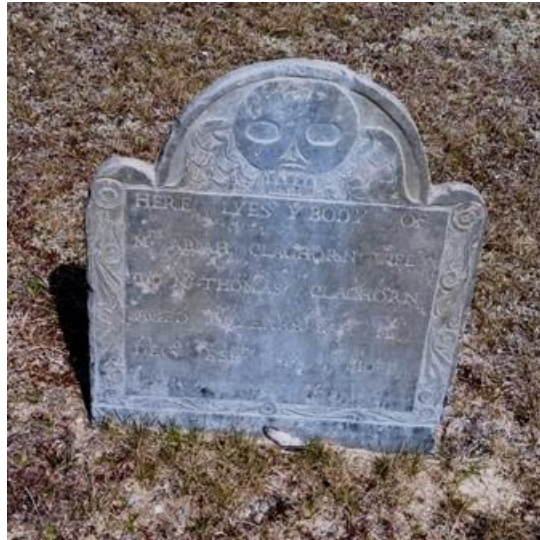
After 2017 Restoration