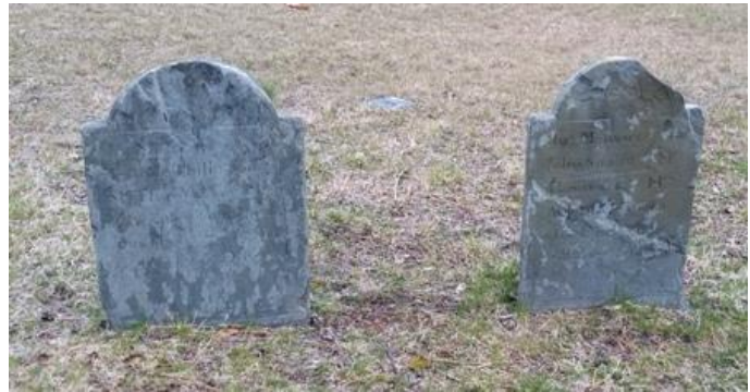
With Temple Philip Cooke Gravestone