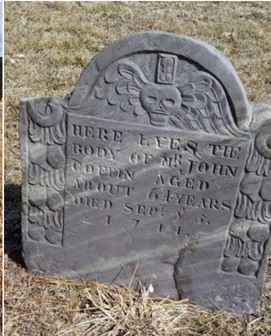
After 2017 Restoration