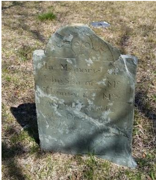
After 2017 Restoration