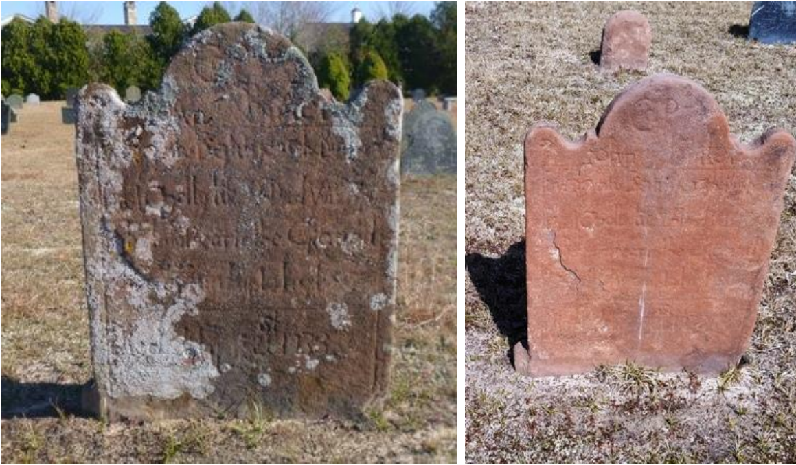
After 2017 Restoration