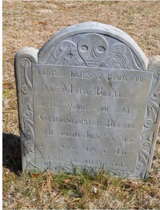
After 2017 Restoration