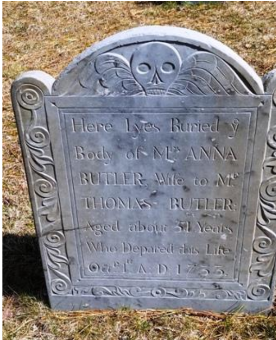
After 2017 Restoration