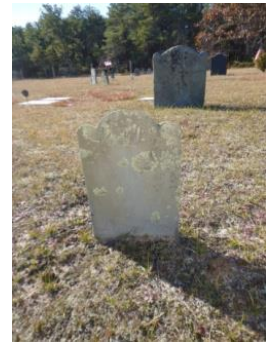
After 2017 Reconstruction