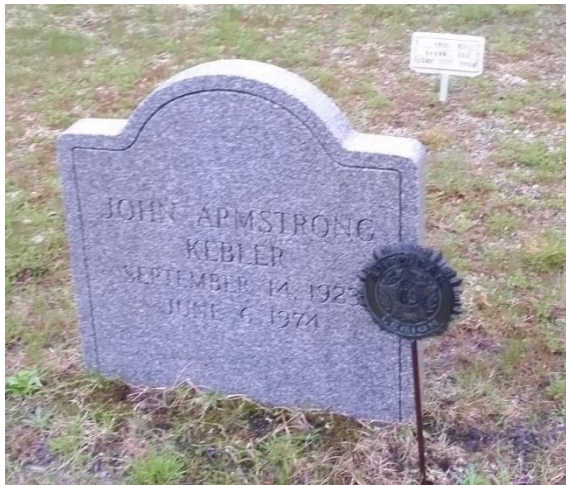
Temporary marker behind Kebler