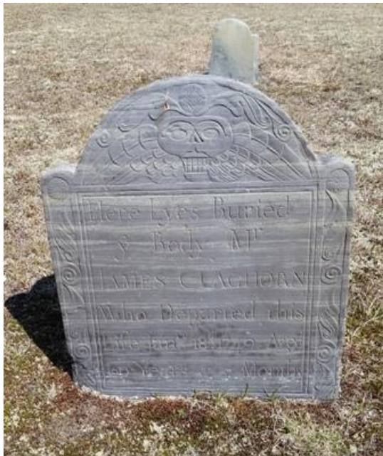
After 2017 Restoration