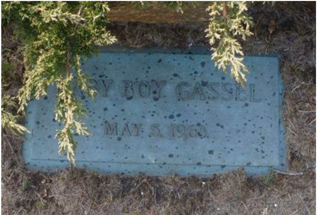
BABY BOY GASSEL MAY 15, 1963