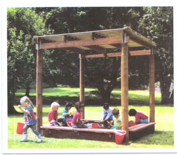
SUN SHELTER SANDBOX $5,815