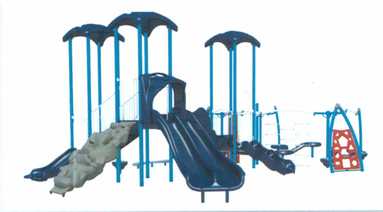
CLIMBING STRUCTURE $74,104